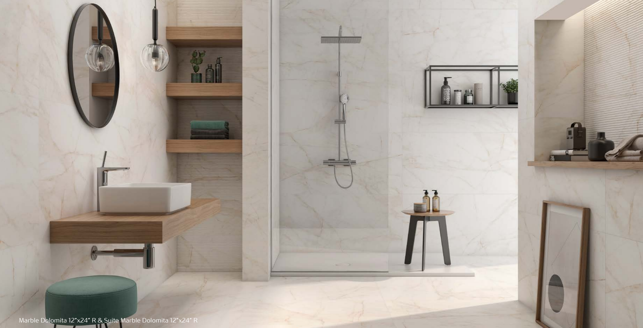
Marble Dolomita 12"x24" R & Suite Marble Dolomita 12"x24" R