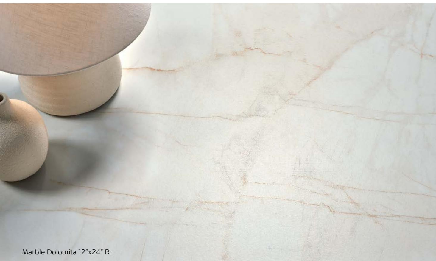
Marble Dolomita 12"x24" R