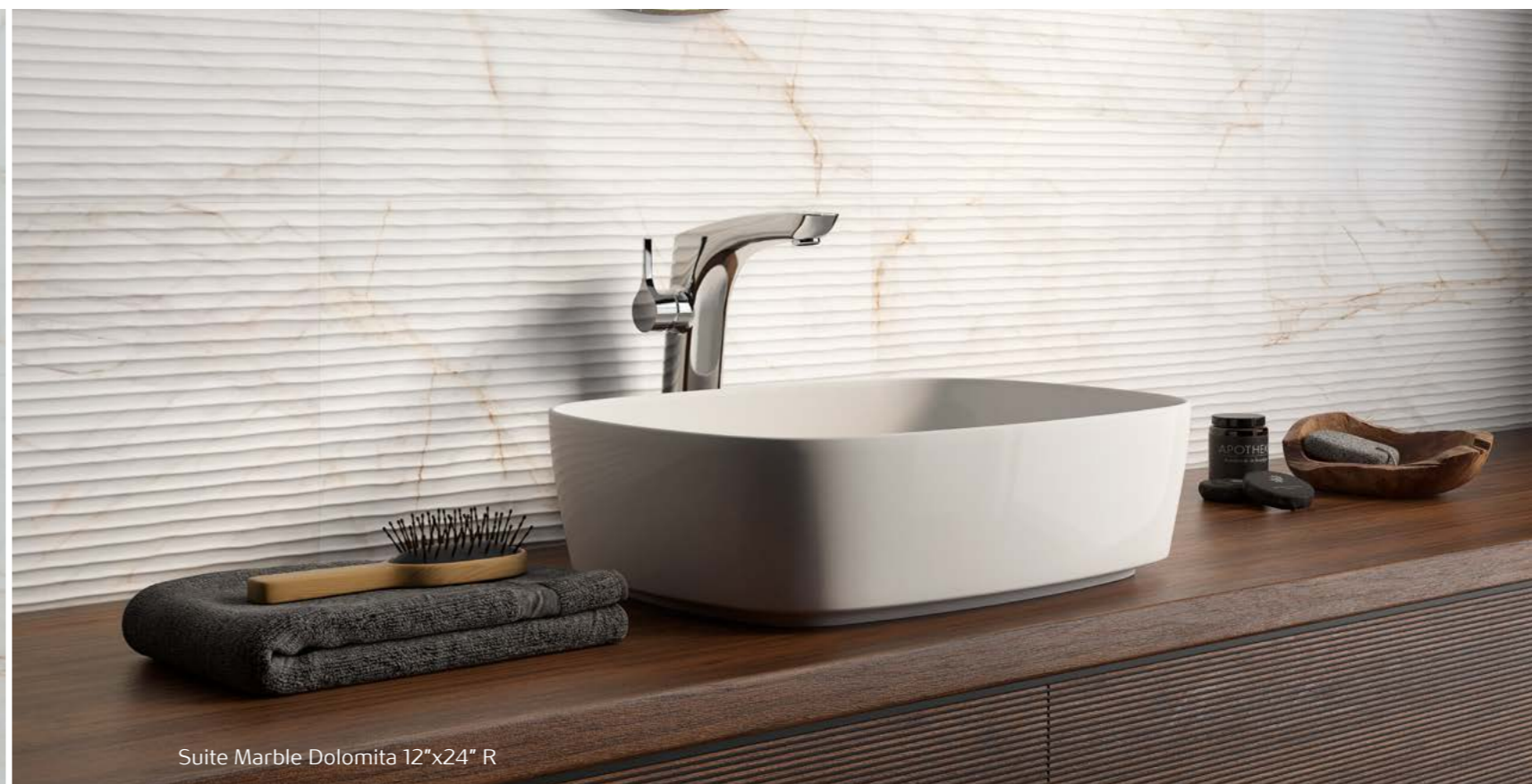
Suite Marble Dolomita 12"x24" R